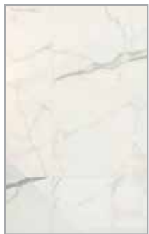
BIANCO VENATO EXTRA