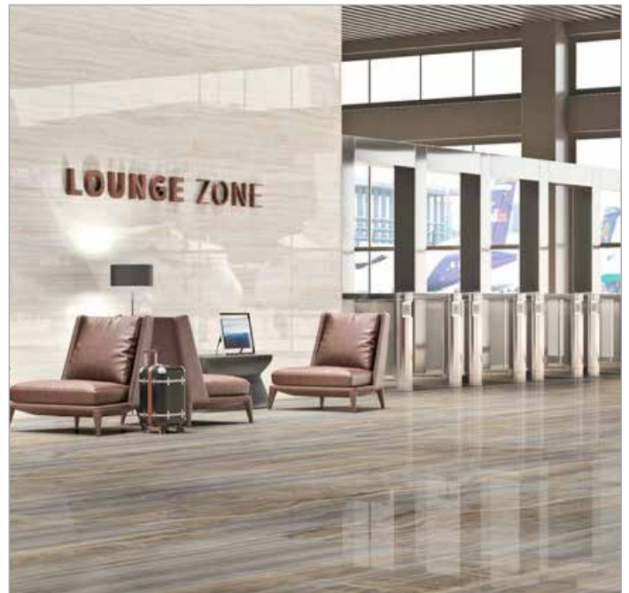
ONICE GRIGIO & ONICE AVORIO