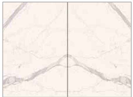
BIANCO VENATO EXTRA BLOCK BOOK MATCH A & B

Established in 1979 in Boise as Idaho's premier wholesale tile, brick, and stone distributor. The Masonry Center, Inc. has expanded throughout the northwest. Our strong commitment to customer service combined with the buying power of five locations offers our customers in Idaho, Montana, Washington and Wyoming, unparalleled selections and service.