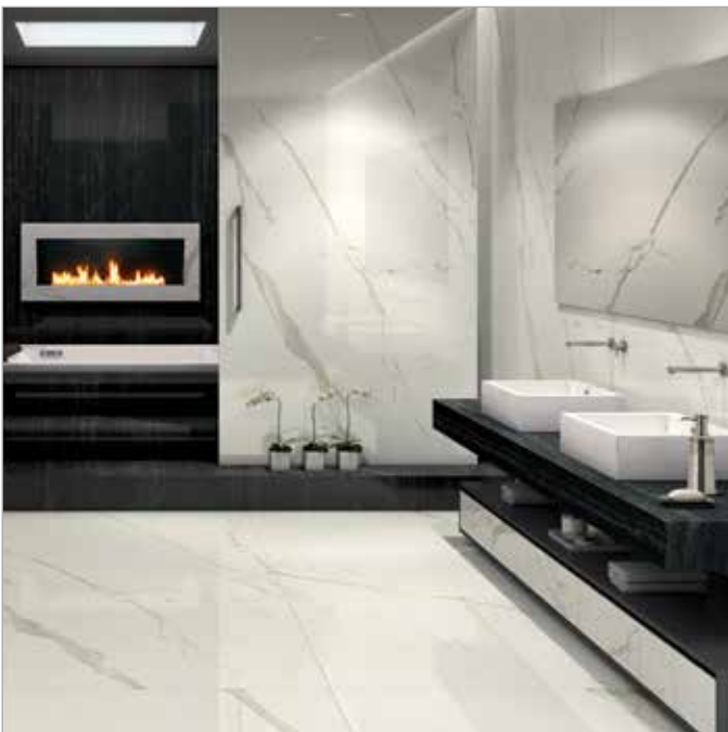
BIANCO & BLACK VENATO EXTRA