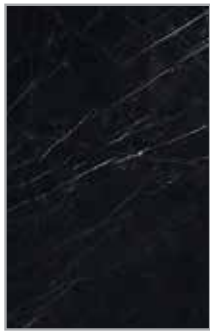
BLACK MARGUINIA POLISHED/SILKY